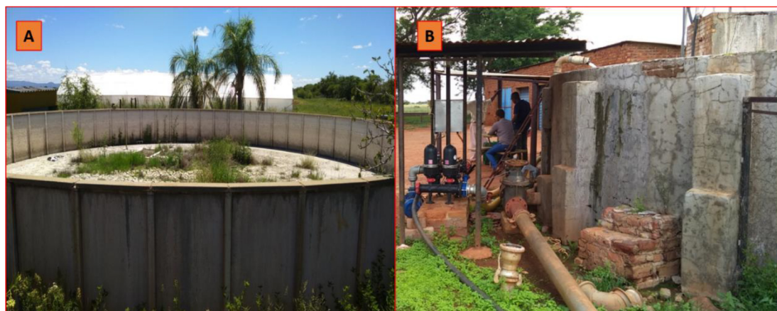
Figure 3. Typical water storage facilities in disrepair observed in Bela-Bela

We set out to generate empirical data that demonstrates the extent to which access to water may or may not be assured for emerging farmers once they obtain redistributed land, as well as the main challenges that limit use of the water available for economic production in Bela-Bela and Greater Sekhukhune. Findings from this study have enabled us to reach firm conclusions on this. For the majority of the farmers, access to water is not guaranteed and this negatively affects their